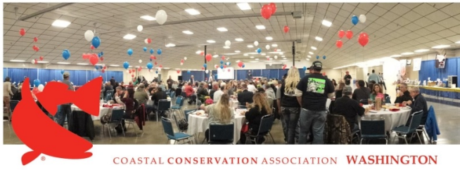
COASTAL CONSERVATION ASSOCIATION WASHINGTON

Let's begin the excitement by sharing some fantastic news about our CCA Lower Columbia Chapter . After a several year hiatus, the CCA Lower Columbia Chapter is making a return. They are set to launch our fall banquet schedule with their fundraising banquet on September 15, 2023, at the McClelland Arts Center. For ticket purchases or table reservations, CLICK HERE .